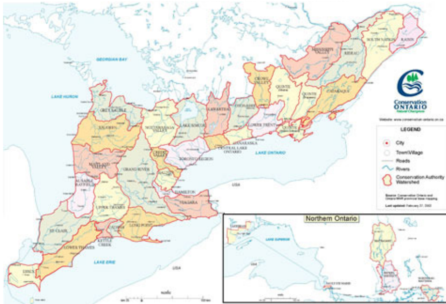
FIGURE 2: CONSERVATION AUTHORITIES OF ONTARIO

There is a number of conservation authorities located in each of Ontario's three regions. Main offices for each authority are listed with contact information on the following pages.