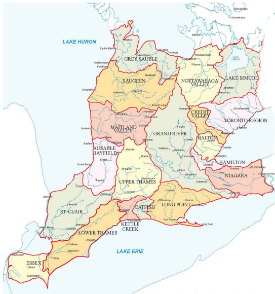
FIGURE 3: CONSERVATION AUTHORITIES OF ONTARIO – SOUTHWESTERN REGION