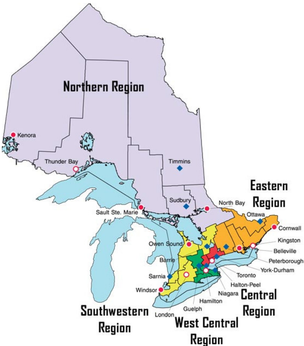
FIGURE 1: MAP OF MINISTRY REGION

This list may be found at http://www.ene.gov.on.ca ; (click on 'Contact' and then click on 'Regional Offices')