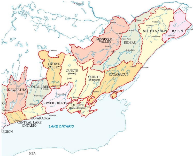
FIGURE 4: CONSERVATION AUTHORITIES - SOUTH-EASTERN REGION