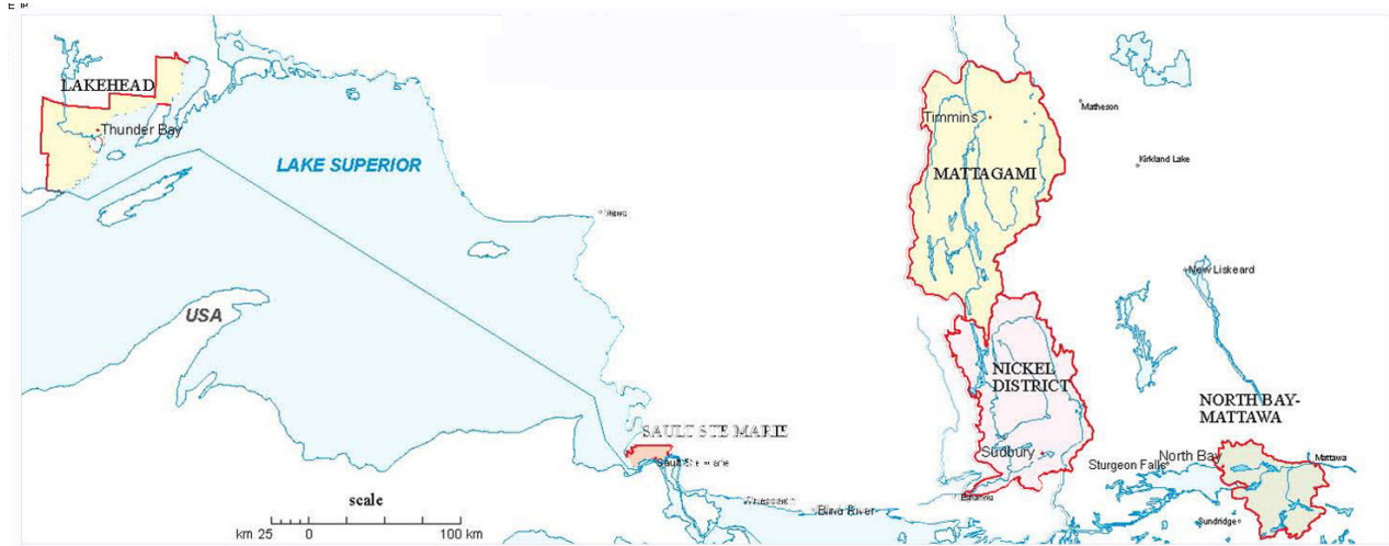
FIGURE 5: CONSERVATION AUTHORITIES - NORTHERN REGION