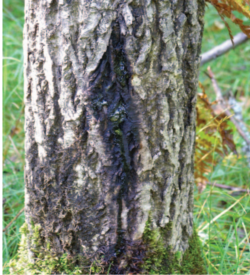
Oozing butternut canker.