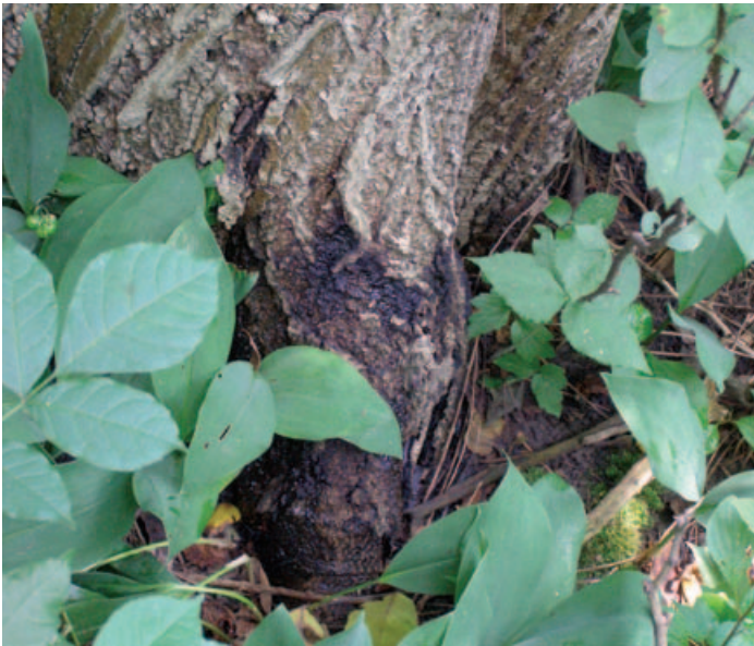
Black fluid oozing from cracks in the bark.