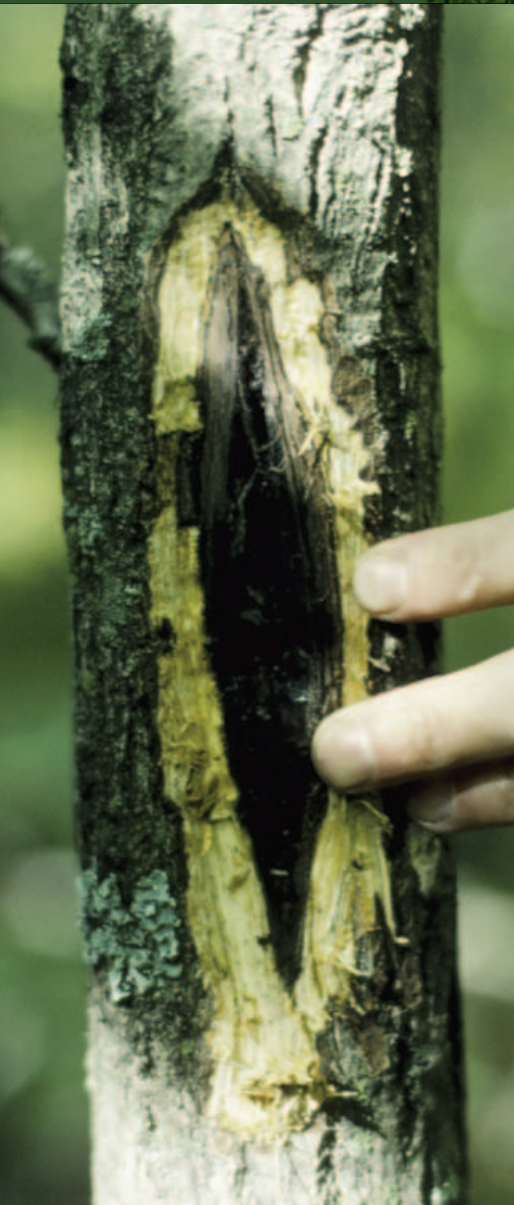
Young butternut showing established canker. The cankers cut off the flow of water and nutrients and can kill an otherwise healthy tree.