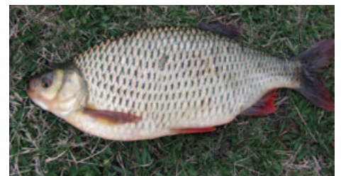
Rudd is a deep bodied minnow.