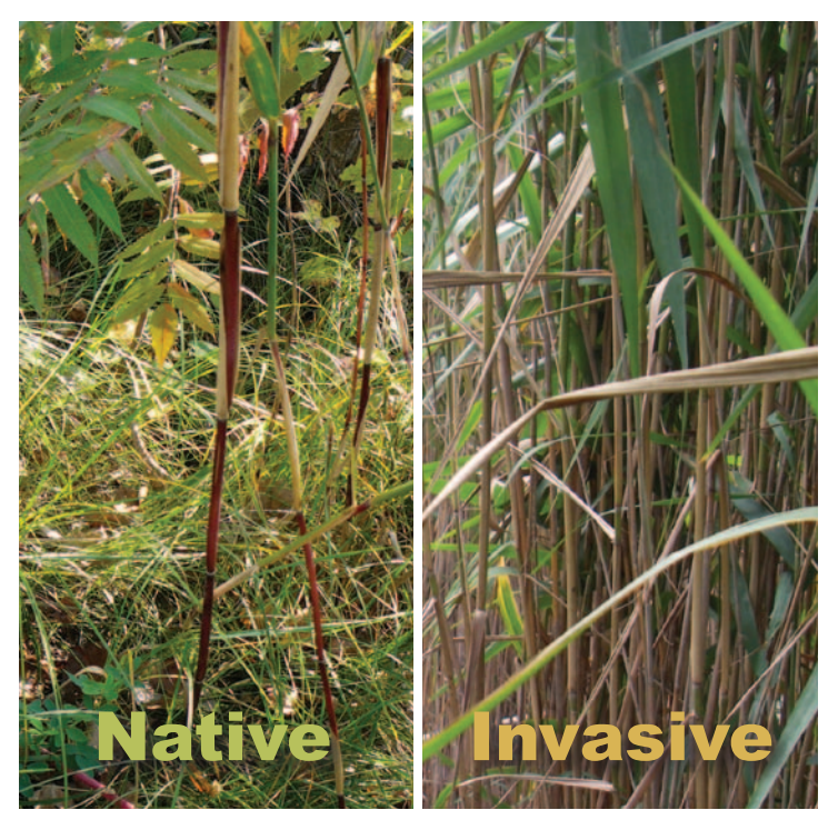
Figure 2: A native Phragmites stem (left) and an invasive Phragmites stem (right). Note the reddish brown native stem on the left, and the tan/beige invasive stem on the right.

Native stand photo courtesy of Erin Sanders, MNR. Invasive stand photo courtesy of Janice Gilbert, MNR.