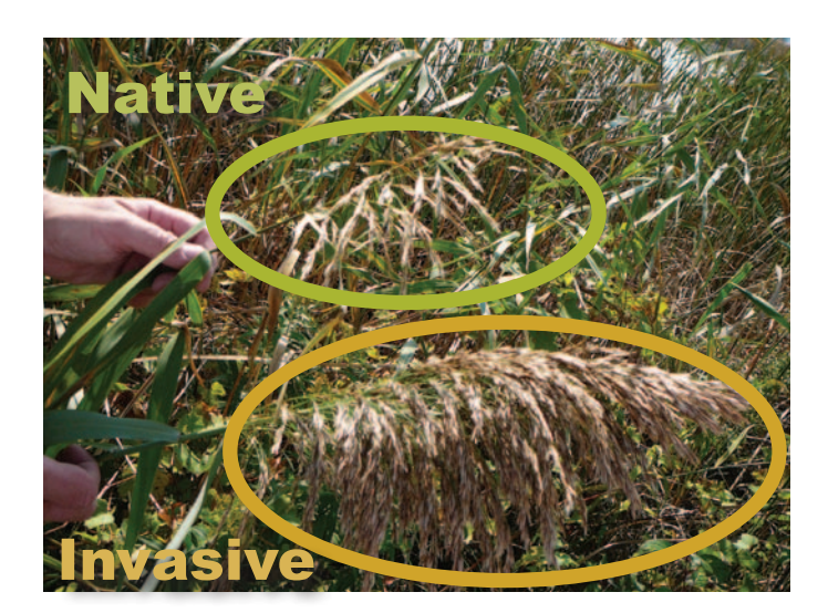
Figure 4: A native Phragmites seedhead (top) and an invasive Phragmites seedhead (bottom). Note that the native Phragmites seedhead is smaller and sparser compared to that of the invasive Phragmites .