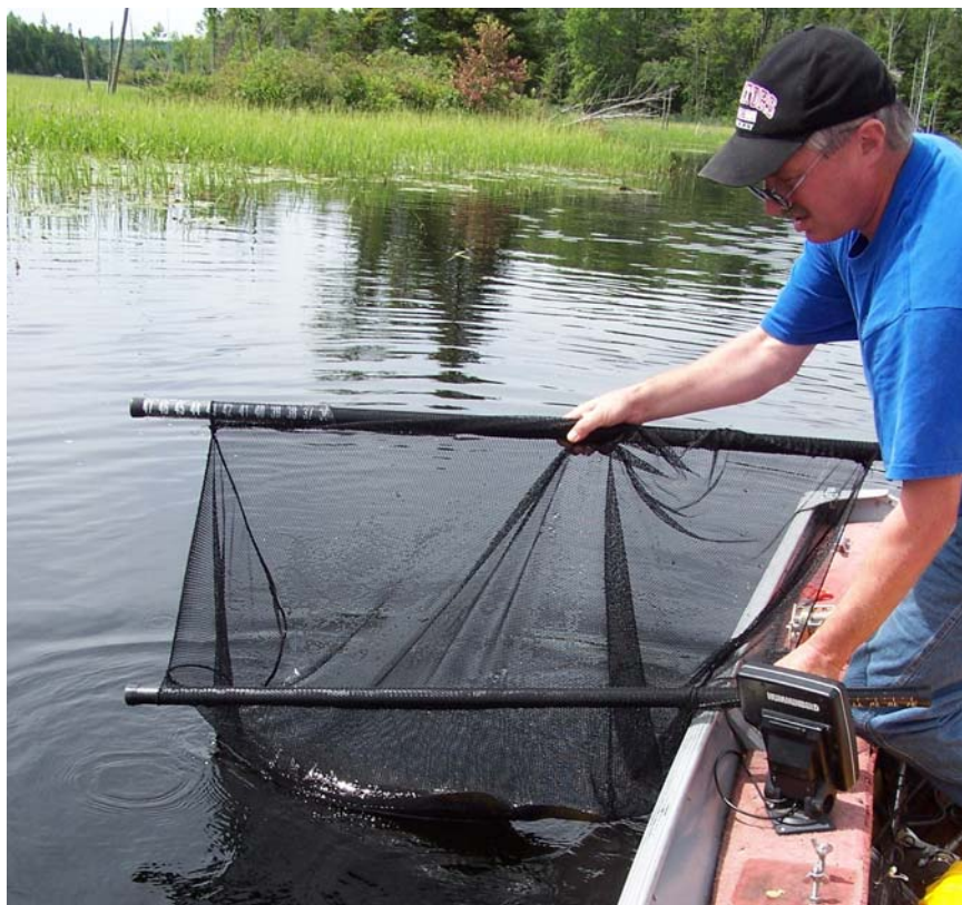
Figure 3. Muskellunge being handled using a cradle

Despite the widespread use of landing nets by anglers there has been relatively little investigation into the damage caused by their use or which of the available types of net result in the lowest injury to fish. Generally, it is recommended that the use of landing nets be limited as it is thought to increase fin damage, and remove the protective mucus layer, thus increasing susceptibility to disease. Barthel et al. (2003) examined the effects of landing net mesh type on injury and mortality in bluegill. They quantified the effects of netting for a 168 h period after capture and found that there was zero mortality in fish that were landed without a net while fish that were landed with a net experienced a mortality rate of 4 to 14%. There was also increased pectoral and caudal fin abrasion and dermal disturbance (scale and mucus loss). Of the four types of landing net mesh types compared (rubber, knotless nylon, fine knotted nylon and coarse knotted nylon), the knotted mesh types resulted in greater injury and mortality than rubber or knotless mesh. Thus, injury (and therefore mortality) can be reduced if the use of landing nets is limited to those instances where their use is required to safely land and control fish to prevent mechanical injury. However, when the use of a landing net is required or preferred, it is best to use one made of rubber or knotless mesh.