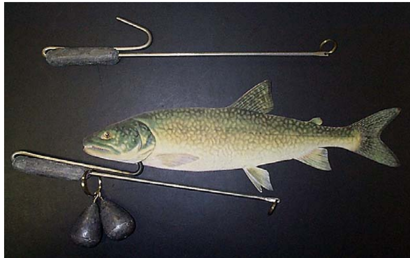
Figure 2. Apparatus used for deep release of lake trout

When fish are caught and retrieved quickly from deep water, injury may result from depressurization. Depressurization can result in over-inflation of the gas bladder, inability to submerge when released, gas embolisms, internal and/or external haemorrhaging and death. Freshwater fish have one of two basic types of swim bladders. Fish, such as carp, esocids, trout and salmon have a duct which connects the swim bladder to the alimentary canal. These fish can expel gas and make buoyancy adjustments more quickly than fish such as, bass, walleye, perch and most panfish which lack a connecting duct and rely on diffusion to deflate their swim bladder. Thus, while susceptibility to depressurization varies among fish species, it has the potential to be a significant source of mortality (Kerr, 2001).